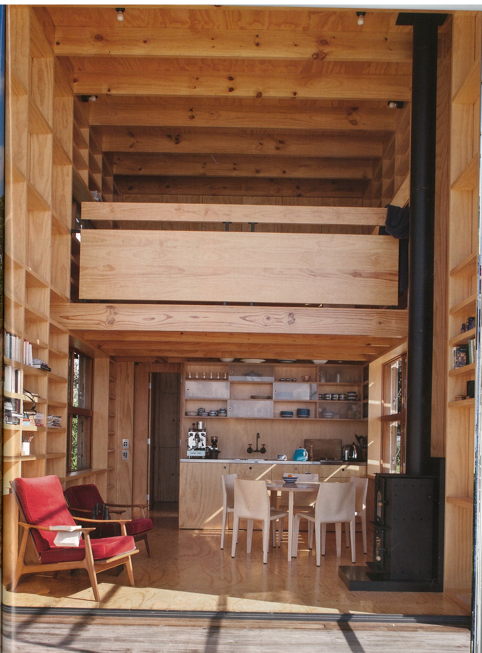
Nicknamed the 'Hut on Sleds', this holiday home on New Zealand's North Island, designed by Crosson Clarke Carnachan Architects, sits on just 40 square metres. OPPOSITE PAGE: the 'everything-room' is simply furnished with a circular dining table by the architects, 'Laleggera' chairs by Riccardo Blumer for Alias from Corporate Culture, velvet vintage Parker chairs bought online, and a 'Studio' wood-burning fireplace from Warmington Fires. Details, last pages.